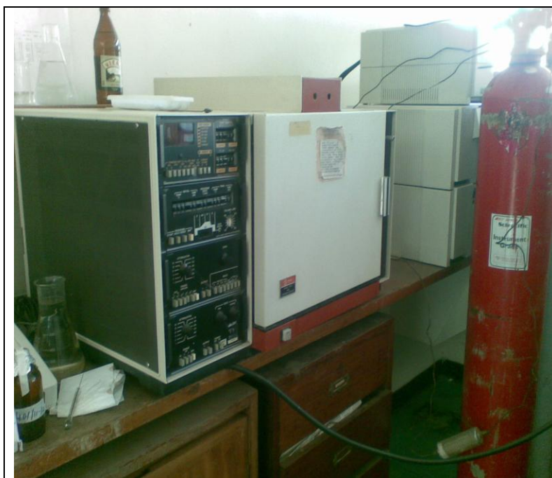
Figure 1: Alcohol Analyser Machine at the Government Chemist.

Procedure: 10 Microlitres of the sample were mixed with 250 ml of internal standard (propanol) of known concentration. 1-2 microliter of the mixture was then injected into the gas chromatograph. Calculation; since the molecular weight of ethanol, methanol and propanol are different; there was clear separation from the resultant chromatograph. The peak height ratio (or peak area) of the unknown to the internal standard, n -propanol was done and was compared with the ratio obtained for the corresponding calibrators the concentration of alcohol was given as g/L.