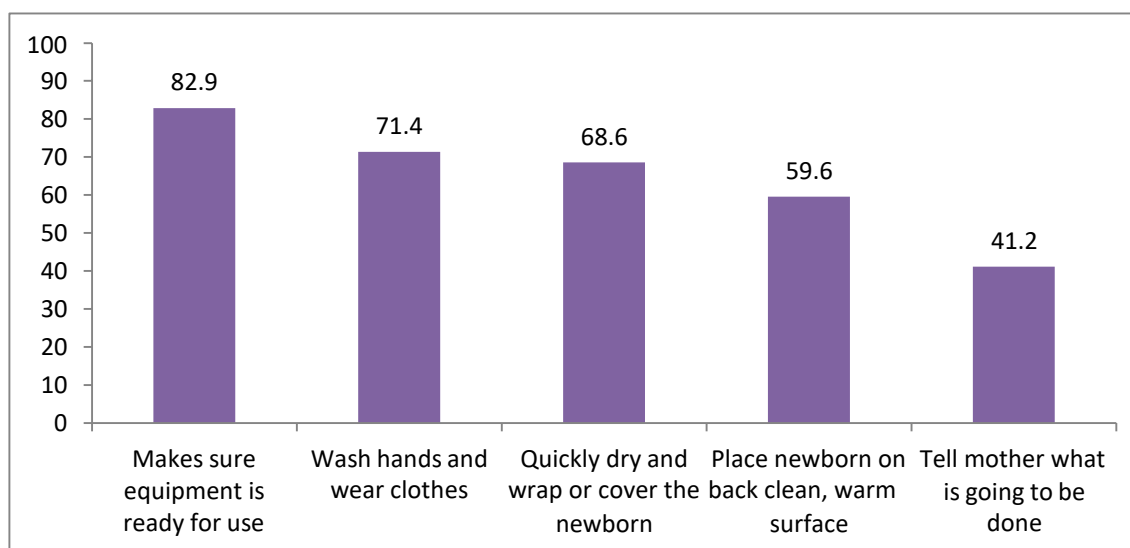
Fig 1: Preparation for Resuscitation.

Skills on Neonatal Resuscitation: The figure below illustrates the neonatal resuscitation skills.