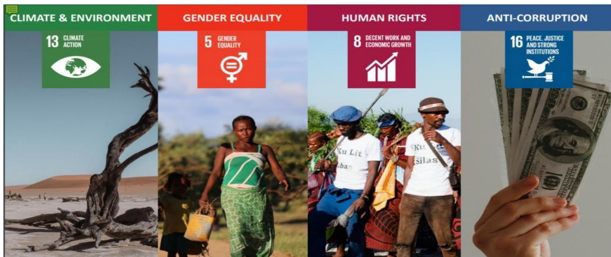
Figure 2. Norfund's Sustainable Interests

funks Norfund with the aim of strengthening the private sector and reducing poverty in developing countries. Norfund targets selected countries where capital is scarce where international investments will have a great impact. Norfund has invested in 29-core countries transport, which was selected due to high investment needs, limited access to capital/investors and Norfund's knowledge of the market. Additionally, it has invested in 20 more developing countries that are fragile and offer partnership opportunities through reputable private equity funds, strategic partnership and investment platforms. For example, Norfund financed Asilia Africa, which is East Africa's market-leading safari operator. Being a responsible investor, the institution is concerned with climate and environment, corruption prevention, human rights and gender equality.